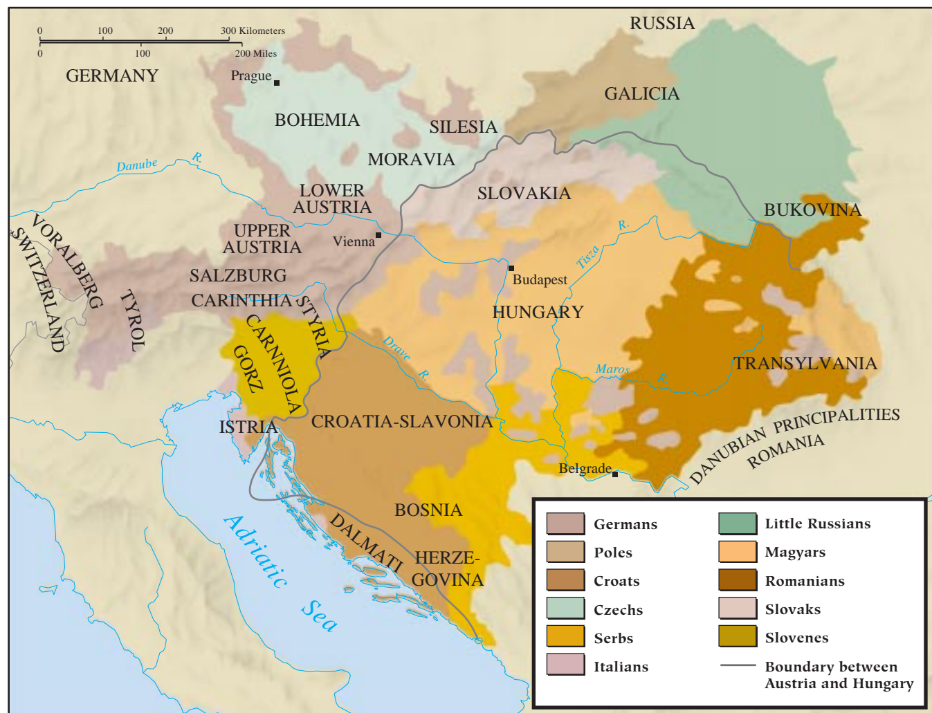
MAP 22.3 Ethnic Groups in the Dual Monarchy, 1867.

Only when military disaster struck again did the Austrians deal with the fiercely nationalistic Hungarians. The result was the negotiated Ausgleich , or Compromise, of 1867, which created the dual monarchy of Austria-Hungary. Each part of the empire now had its constitution, its own